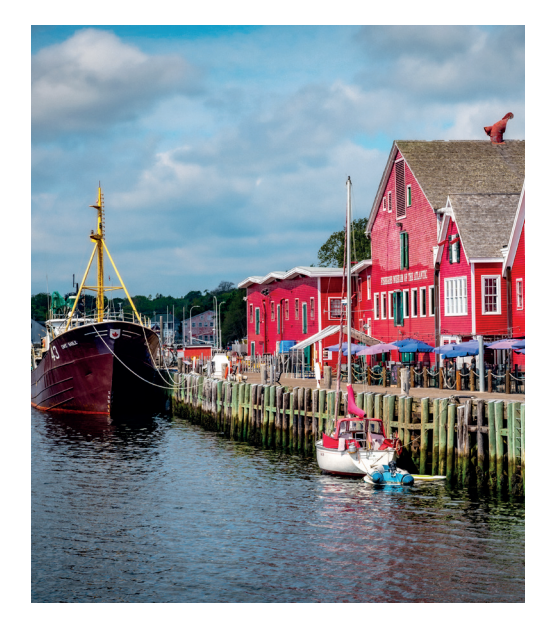
Clockwise from above: Lunenburg waterfront; the iconic Peggy's Cove Lighthouse; the Museum of Immigration at Pier 21; dusk over Halifax Harbour

+ For more tips on your favourite cruise destinations, go to cruiseandtravel.co.uk